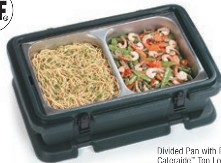
Divided Pan with PC140N Cateraide™ Top Loader