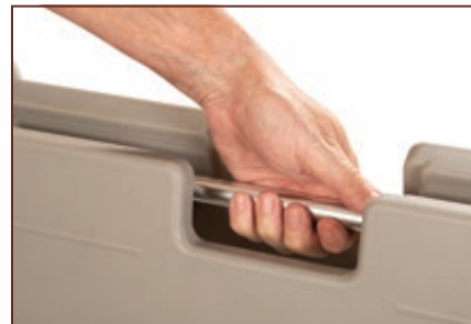
Easily folds with one hand