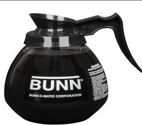
DECANTER, GLASS-BLK 12C 3/CS