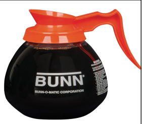
DECANTER, GLASS-ORN 12C 24/CS