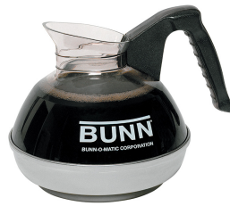
EASY POUR,(BLK) 12/CS