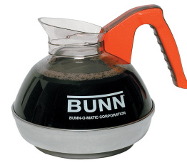
EASY POUR,(ORN) 12/CS