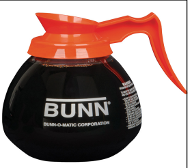
DECANTER, GLASS-ORN 12C 3/CS