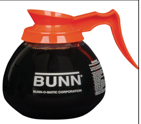
DECANTER, GLASS- ORN 12 CUP 1PK