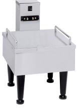
1SH STAND, CE 220-240V 50-60 HZ EURO