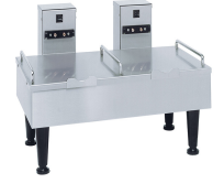
2SH STAND, 120V