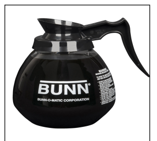
DECANTER,GLASS-BLK 12C 24/CS