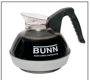
EASY POUR®, (BLK) 2/CS