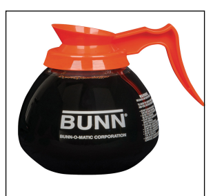
DECANTER,GLASS-ORN 12C 3/CS