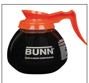
DECANTER, GLASS-ORN 12 CUP 1PK