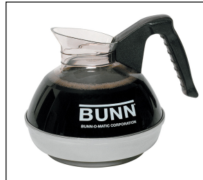
EASY POUR®,(BLK) 12/