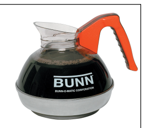
EASY POUR®,(ORN) 24/ CS