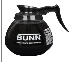
DECANTER,GLASS-BLK 12CUP 1PK