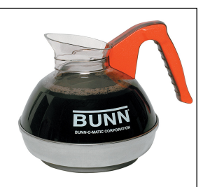
EASY POUR,(ORN) 12/ CS