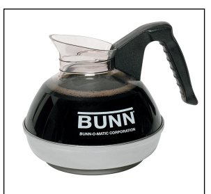
EASY POUR®, (BLK) 6/CS