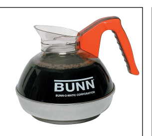
EASY POUR®,(ORN) 6/