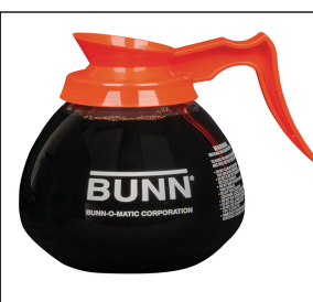
DECANTER,GLASS-ORN 12C 24/CS