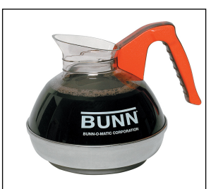
EASY POUR®,(ORN) 2/