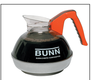
EASY POUR®,(ORN) 3/