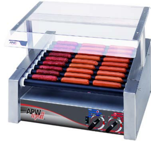
Model: HRS-31S Roller Grill with SGXP-31 Sneeze Guard