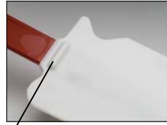
Clean-Rest™ reduces risk of cross-contamination.