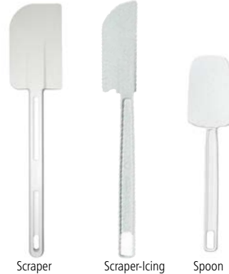
Scraper Scraper-Icing Spoon