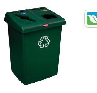
Two-Stream Glutton® Recycling Station 1792340

· 2-stream and 4-stream options are available