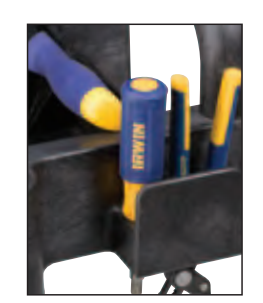
STAY ORGANIZED Easy-reach tool/accessory hooks provide additional storage.