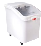
FG360388 600 Cups 188 lb flour