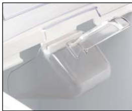
Dedicated internal scoop storage meets safety compliance.