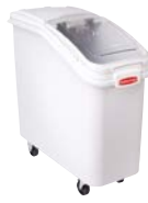
FG360088 400 Cups 124 lb flour