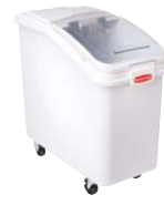
FG360288 500 Cups 154 lb flour