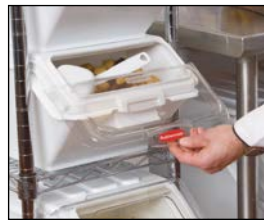
Speed up food preparation with one-handed access.