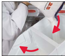
Ensure proper food rotation with FIFO barrier.

65% PRODUCTIVITY SAVINGS with one-handed access