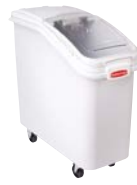
FG360088 400 Cups 124 lb flour