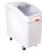
FG360288 500 Cups 154 lb flour