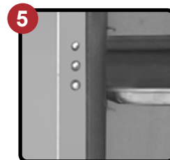
Field Reversible Door