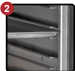
Unique Pan Slides