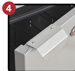
Magnetic Work Flow Handles