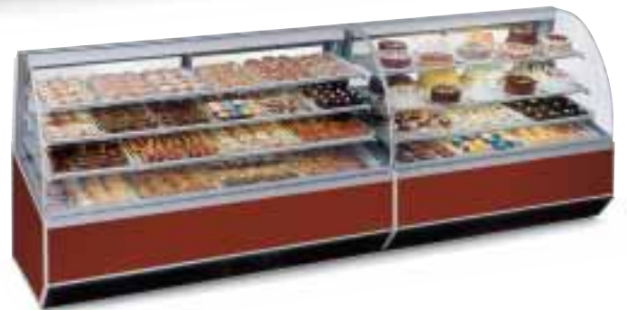
Series '90 Non-Refrigerated and Refrigerated Bakery System for maximum visual appeal