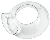
WSM7LSG Splash Guard/Feed Chute