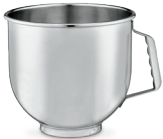
WSM7LBL 7-Quart Stainless Steel Bowl