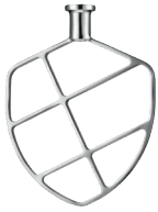
WSM7LMP Stainless Steel Mixing Paddle