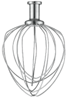
WSM7LW Stainless Steel Chef's Whisk