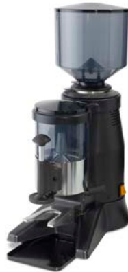
Silent Semi-Automatic MG 300