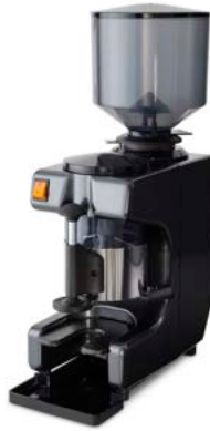
Automatic MG 008