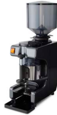
Semi-Automatic MG 006