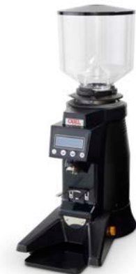
Super Automatic MG 100