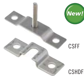
Hole diameter 9/16".