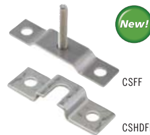
Hole diameter 9/16".