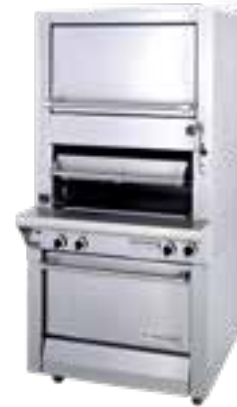
The M100XM features the standard oven, a warming oven and a broiler.

The right combination of power and control opens up a world of menu possibilities, making this broiler multi-functional and more versatile than traditional broilers. Your entire staff can do more with the M110XM than with a traditional infra-red broiler. The M110XM is a proven performer in any application. It's the perfect à la carte broiler for hotel or restaurant dining rooms, yet heavy duty enough to function as a steak and chop broiler in a steak house or banquet environment.