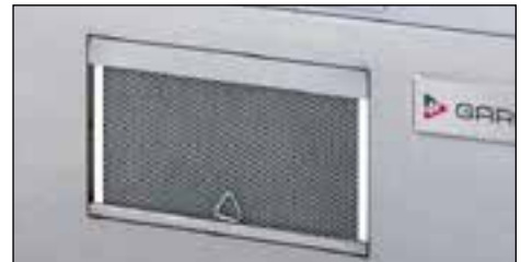
Easy to clean, removable air filter.

Redesigned, filtered combustion airflow features filters that are front-mounted far away from the broiling chambers for safe, easy removal and cleaning. Regular maintenance is fast and simple.