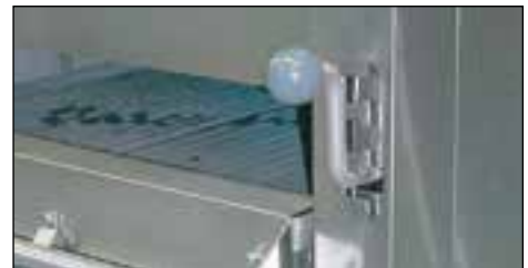
New offset rack adjustment handle design keeps the handle, and your hand, out of the heat zone.

New rack handle design and placement ensures the handle is out of the path of infra-red rays. The handle stays cool-to-the-touch enhancing ease of use and operator safety.