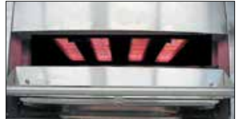
High-performance, infra-red burners

2 Enclosed broiling chambers and efficient use of infrared heat result in a cooler working space around the new M110XM. Cooler, more comfortable employees will be happier, more productive, and more efficient!