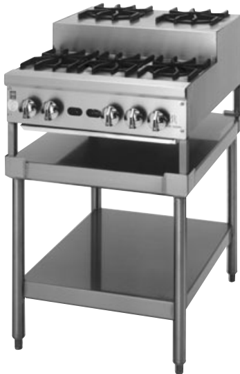
JHPE-3-224 shown with ST-24