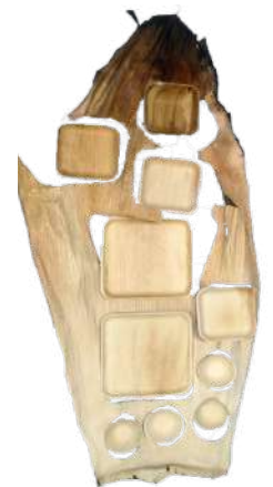
Palm leaf becoming VerTerra Dinnerware