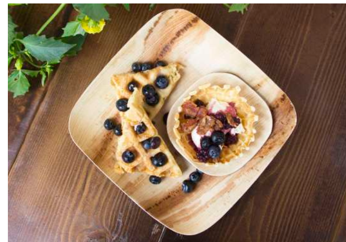
sku 01-20-25B, 01-22-10B