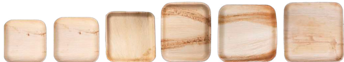
5"x 5" PLATE sku 01-22-13B Qty: 300 sku 01-22-13H Qty: 100 6"x 6" PLATE sku 01-22-15B Qty: 300 7"x 7" PLATE sku 01-00-16B Qty: 300 sku 01-00-16H Qty: 100 7"x 8.5" PLATE sku 01-22-22B Qty: 300 8"x 8" PLATE sku 01-20-20B Qty: 300 9"x 9" PLATE sku 01-20-25B Qty: 300 sku 01-20-25H Qty: 100