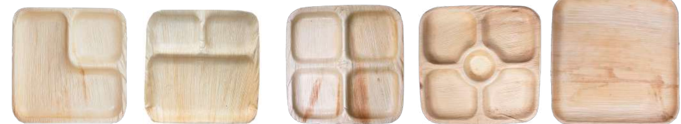
9"x 9" TWO COMPARTMENT PLATE sku 02-25-02C Qty: 300 9" x 9" THREE COMPARTMENT PLATE sku 02-25-03C Qty: 250 9" x 9" FOUR COMPARTMENT PLATE sku 02-25-04C Qty: 300 9" x 9" FIVE COMPARTMENT PLATE sku 02-25-05C Qty: 300 10"x 10" PLATE sku 01-20-25C Qty: 300