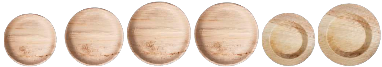
7" ROUND PLATE sku 01-01-20B Qty: 300 8" ROUND PLATE sku 01-01-22B Qty: 300 10" ROUND PLATE sku 01-01-25B Qty: 300 10" DEEP ROUND PLATE sku 01-00-30D Qty: 300 6" ROUND LIP PLATE sku 01-33-15B Qty: 300 9" ROUND LIP PLATE sku 01-33-25B Qty: 300 sku 01-01-20H Qty: 100 sku 01-01-25H Qty: 100 sku 01-33-15H Qty: 100

Our wide range of dinnerware is the solution to matching your sustainability goals with your business practices. Pat. and Pat. Pending: www.verterra.com/pages/patent