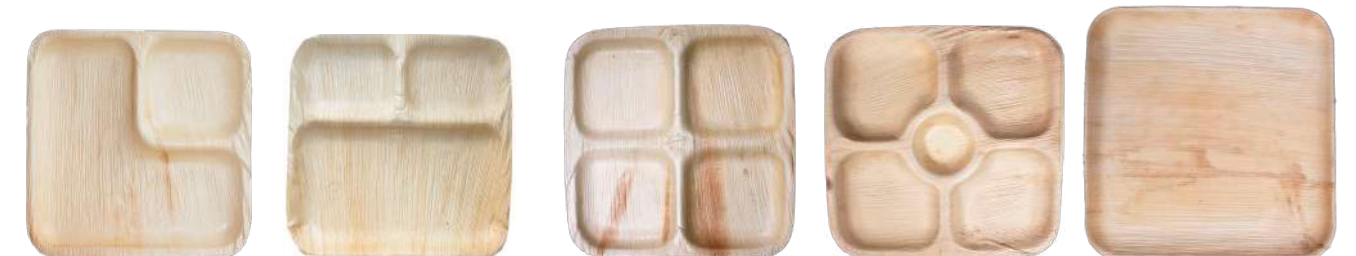
9"x 9" TWO COMPARTMENT PLATE sku 02-25-02C Qty: 300 9" x 9" THREE COMPARTMENT PLATE sku 02-25-03C Qty: 250 9" x 9" FOUR COMPARTMENT PLATE sku 02-25-04C Qty: 300 9" x 9" FIVE COMPARTMENT PLATE sku 02-25-05C Qty: 300 10"x 10" PLATE sku 01-20-25C Qty: 300