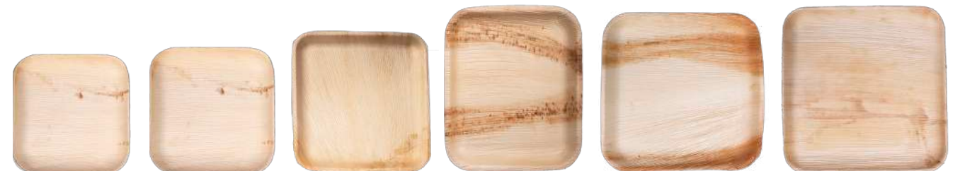
5"x 5" PLATE sku 01-22-13B Qty: 300 sku 01-22-13H Qty: 100 6"x 6" PLATE sku 01-22-15B Qty: 300 7"x 7" PLATE sku 01-00-16B Qty: 300 sku 01-00-16H Qty: 100 7"x 8.5" PLATE sku 01-22-22B Qty: 300 8"x 8" PLATE sku 01-20-20B Qty: 300 9"x 9" PLATE sku 01-20-25B Qty: 300 sku 01-20-25H Qty: 100