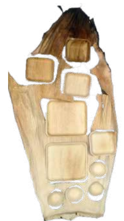
Palm leaf becoming VerTerra Dinnerware