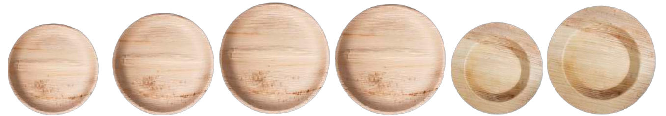
7" ROUND PLATE sku 01-01-20B Qty: 300 sku 01-01-20H Qty: 100 8" ROUND PLATE sku 01-01-22B Qty: 300 10" ROUND PLATE sku 01-01-25B Qty: 300 sku 01-01-25H Qty: 100 10" DEEP ROUND PLATE sku 01-00-30D Qty: 300 6" ROUND LIP PLATE sku 01-33-15B Qty: 300 sku 01-33-15H Qty: 100 9" ROUND LIP PLATE sku 01-33-25B Qty: 300

Our wide range of dinnerware is the solution to matching your sustainability goals with your business practices. Pat. and Pat. Pending: www.verterra.com/pages/patent