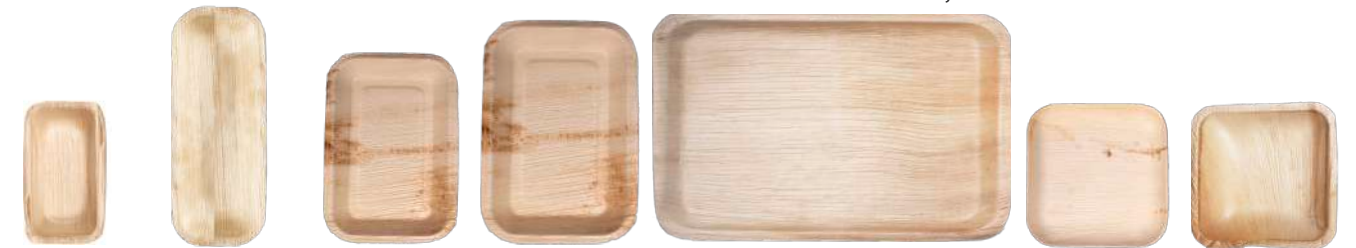
2"x 4" MINI TRAY sku 01-22-05B Qty: 600 4"x 10" TRAY sku 01-22-18B Qty: 300 4.5" x 6" TRAY sku 01-22-12B Qty: 300 6"x 9" TRAY sku 01-22-6X9 Qty: 300 10" x 15.5" TRAY sku 01-00-40T Qty: 50 4"x 4" PLATE sku 01-22-10B Qty: 600 4"x 4" DEEP PLATE sku 01-22-10D Qty: 600 sku 01-22-10DH Qty: 100