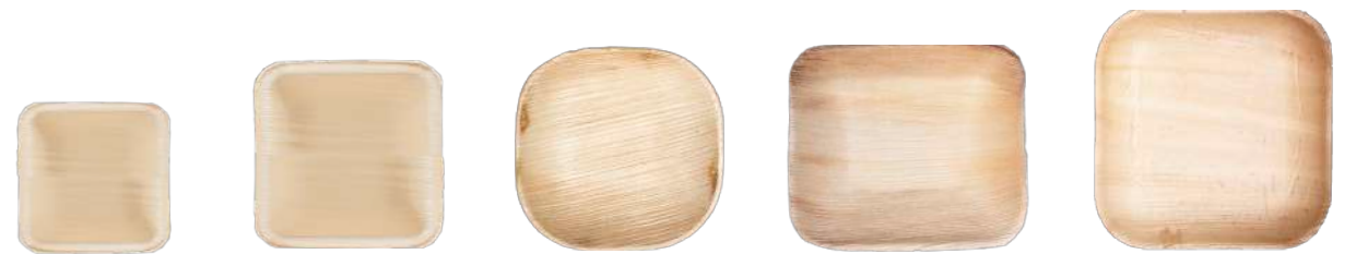
3"x 3" BOWL (2oz) sku 01-01-11B Qty: 600 5"x 5" BOWL (12oz) sku 01-00-18B Qty: 300 sku 01-00-18H Qty: 100 6"x 6" BOWL (12oz) sku 01-00-13B Qty: 300 6"x 8" BOWL (12oz) sku 01-00-15B Qty: 300 sku 01-00-15H Qty: 100 8"x 8" BOWL (24oz) sku 01-00-20B Qty: 300

The possibilities are endless with our range of bowls. The smaller sizes are the industry standard for tastings. The larger sizes elegantly display main dishes, entrées, salads, and more! Our dinnerware is designed to be able to handle hot and cold food/liquids, and oils. Pat. and Pat. Pending: www.verterra.com/pages/patent