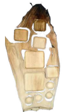
Palm leaf becoming VerTerra Dinnerware