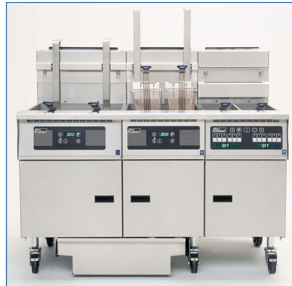
Any Combination, Any Fuel