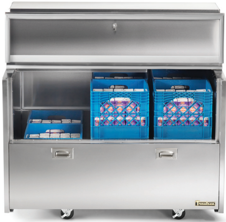
Model Shown - RMC49D4