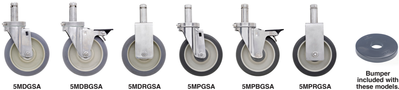
Bumper included with these models.

Note: Rigid connecting channel (stainless steel): Cat. No. 14RS, 18RS, 21RS, 24RS, 30RS, or 36RS.