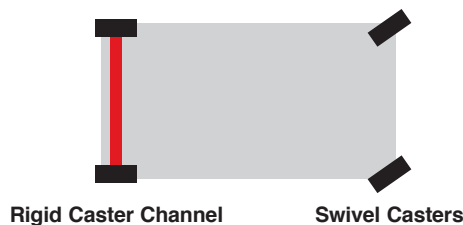
Rigid Caster Channel