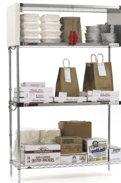
Shown with heated shelf, enclosure kit and standard Super Erecta shelving.