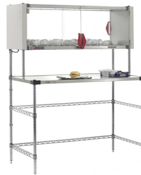
Heated shelf enclosure kit shown with a Super Erecta workstation.