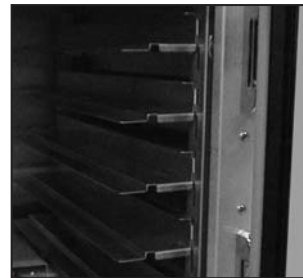
Optional stainless steel adjustable universal slides