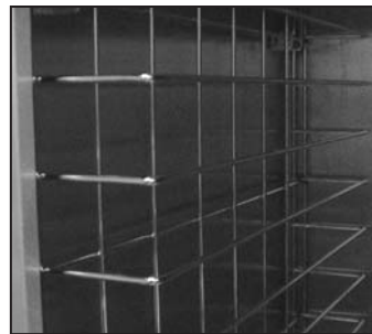
Standard fixed universal wire slides