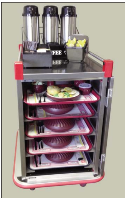
PSDTT10 (shown with optional coffee & tea service)

Since 1947, Foodservice Equipment That Delivers!