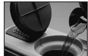
Convenient, safe top filling.