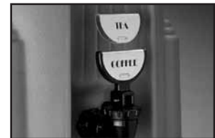
Attractive brass identity plate.