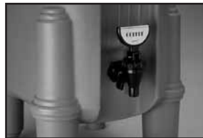
Convenient height dispenser.