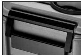
Durable full size nylon latches.