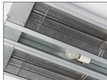
Optional showcase lighting adds visual appeal