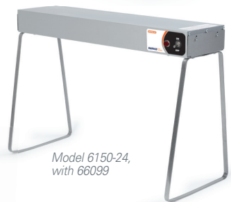
Model 6150-24, with 66099

Power option: Standard on/off toggle switch (shown) or 'infinite' temperature control dial for varying low, medium and high heat settings