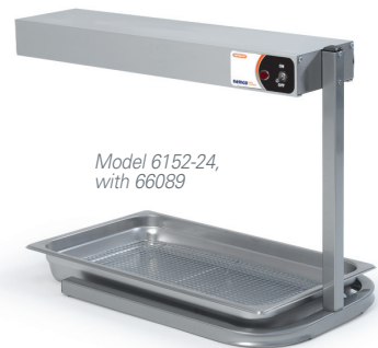
Model 6152-24, with 66089