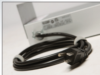
Optional cord-and-plug units simplify installation