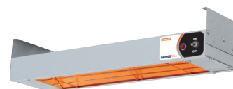
Model 6150-24, with hanging brackets