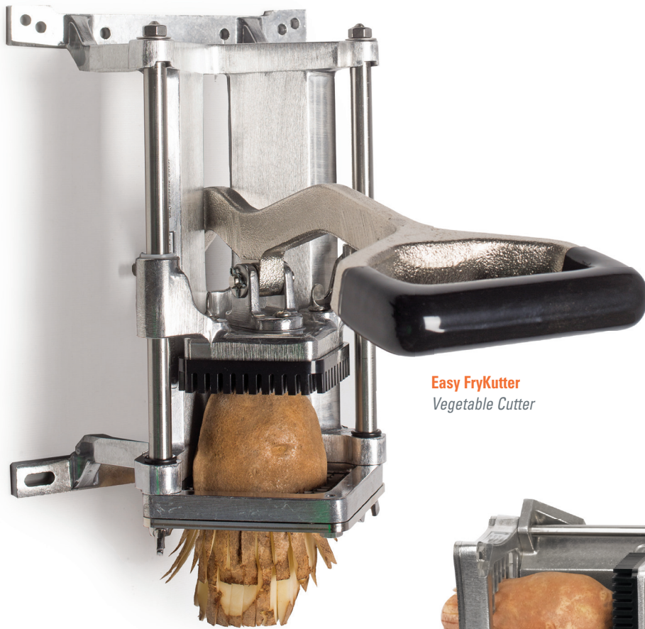
Easy FryKutter Vegetable Cutter

Choose Easy FryKutter for labor savings and improved productivity. Or power through the biggest spuds at lightning speed with the one and only Monster FryKutter.