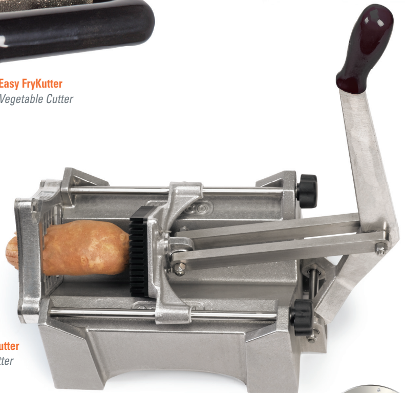
Monster FryKutter Vegetable Cutter

Buy once. Buy the original. Always look for this mark of quality