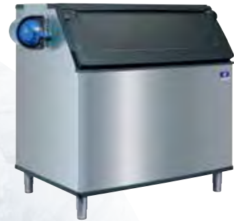
D-Style Ice Storage Bins

Available in 22" (55.9 cm), 30" (76.2 cm) and 48" (121.9cm) widths. Featuring one-piece corrosion-free composite-resin base, impact-resistant polyethylene bin liner, soft durameter trim that helps silence bin closing, internal scoop holder and protectant bumper guards. Optional Multi-mount external scoop holder also available.