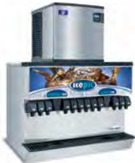
iT420 ice machine on Multiplex® MDH-302 beverage dispenser

Manitowoc dice or half dice cubes crushed into small pieces using a Maniowoc machine and a Multiplex® beverage dispenser equipped with icepic® ice crusher. Provides a selection