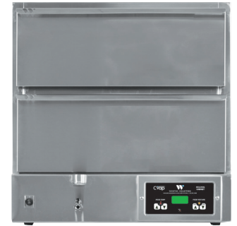
HBB0D2 CVAP HOLD/SERVE DRAWER Electronic Differential Controls