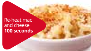
Re-heat mac and cheese 100 seconds