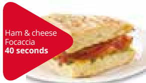
Ham & cheese Focaccia 40 seconds