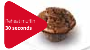
Reheat muffin 30 seconds

All cook times are based on using the Merrychef eikon® e4s. Times may vary depending on food quality and portion size.