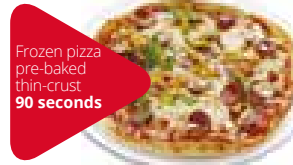
Frozen pizza pre-baked thin-crust 90 seconds