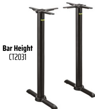
Bar Height CT2031