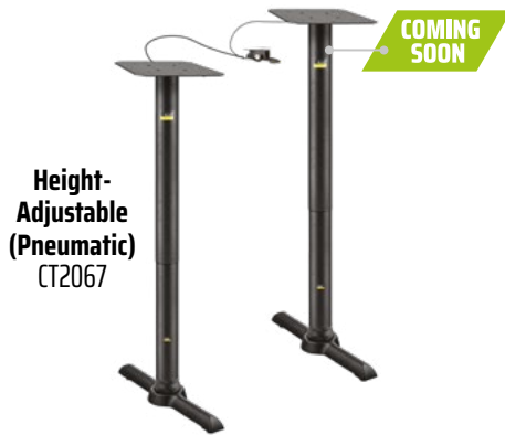
Height-Adjustable (Pneumatic) CT2067