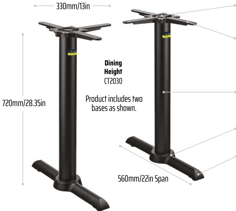
Dining Height CT2030

Our KT22 bases provide a flexible foundation, ideal for larger rectangular table tops and for tables that cater to customers with accessibility requirements.