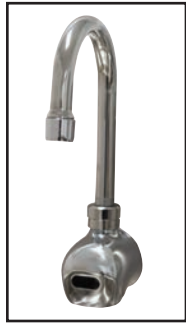
Splash Mount K-175 (Shown)

Conforms To NSF 61/9 Lead Free Requirements