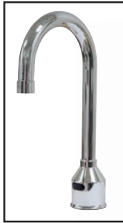
Deck Mount K-180