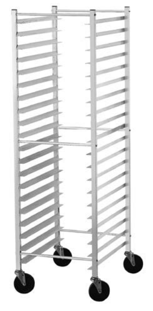
MAXIMUM 500 LB. CAPACITY

For Models: PR10-3K, PR18-3KS, PR20-3KS, PR30-2K