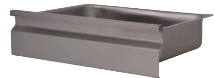
Budget Drawer: FS & FG Series