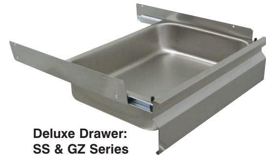
Deluxe Drawer: SS & GZ Series