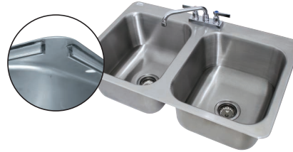
U Channel Installation

The corners of ALL Cutouts are to have a 1-1/4" Radius.