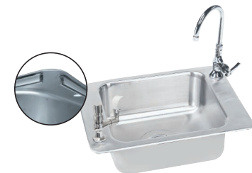
Faucet & Bubbler Optional