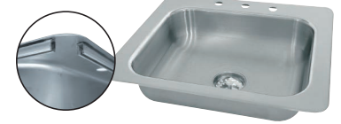
U Channel Installation

NOTE: DBS SERIES DRAINS ARE LOCATED AT THE LEFT REAR CORNER. EACH BOWL INCLUDES 8 9/16" OVERFLOW PIPE WITH 1 1/2" IPS DRAIN.