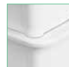
Seamless fit for fresh storage