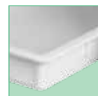
Reinforced edges & corners