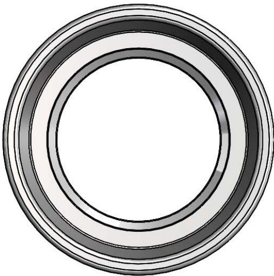
007861-45 B-0107 Sprayhead Ring Qty. = 1