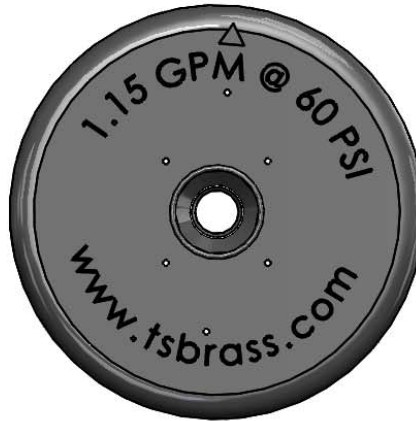
001121-45 B-0107 Spray Face Qty. = 1