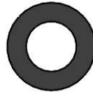
010476-45 #27 Hose Washer Qty. = 2