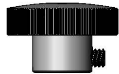
Knob w/ Set Screw (Qty 1)

Product Specifications: Dipperwell Faucet Repair Kit w/ Seat Washers (6), Stem Assembly, Stem Seals (2) & Knob w/ Set Screw