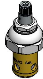
Cold Spindle (Assembled Item Shown for Clarity)