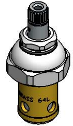
Hot Spindle (Assembled Item Shown for Clarity)