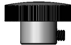
Knob w/ Set Screw (Qty 1)