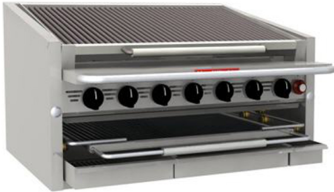
Unit shown with optional lower rack