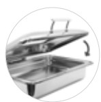
a. Slow closing lid with improved hinge design