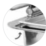
d. New Steam Pan Lifter protects operator from steam burns, making food rotation easier