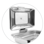
b. Improved hinge design has an integrated stop to keep lid open for serving