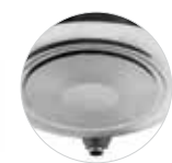
g. Improved induction base integrated into design