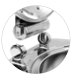
c. Hinge is easier to replace (no tools needed)