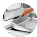
e. Intuitive integrated lip to assist in manually removing steam pans