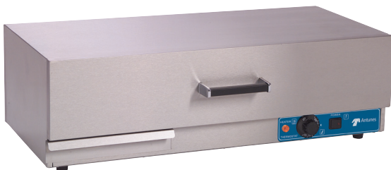
WD-35A with water tray

Ready to serve but tastes like made to order—the Warmer Drawer keeps products fresh and delicious for customers. It features a precision thermostat to adjust the temperature required for your bread product.