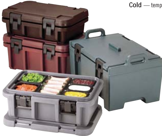
UPC160 Shown with dividers and fractional sized food pans.