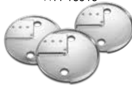
Julienne Discs 4mm – WFP16S22 6.5mm – WFP16S23 8mm – WFP16S24