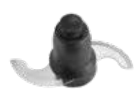
Patented Sealed & Locked S-Blade Locks into place and seals liquids in the bowl WFP16S1