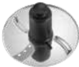
Sealed & Locked Whipping Disc Quickly whips creams and butters WFP16S11