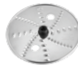
Reversible Shredding Disc Fine shred on one side, coarse shred on the other side WFP16S12A