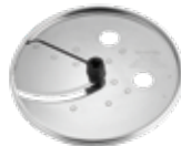
Patented Adjustable Slicing Disc (1–6mm) Provides 16 different thickness options in 1 disc WFP16S10